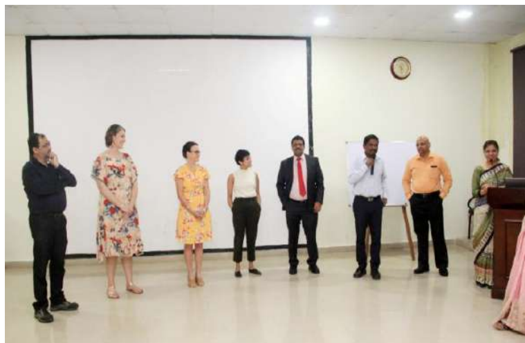
Group activity during the Workshop