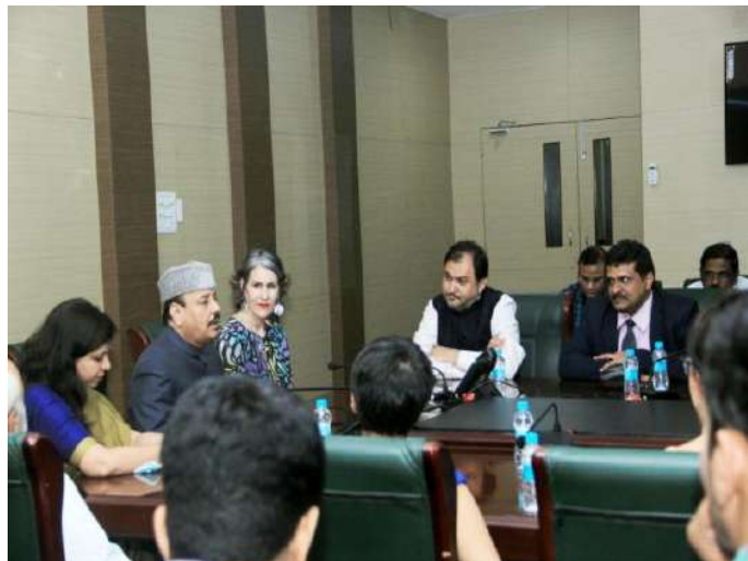
Interaction with Hon. Pro. Chancellor of DMIMS(DU)