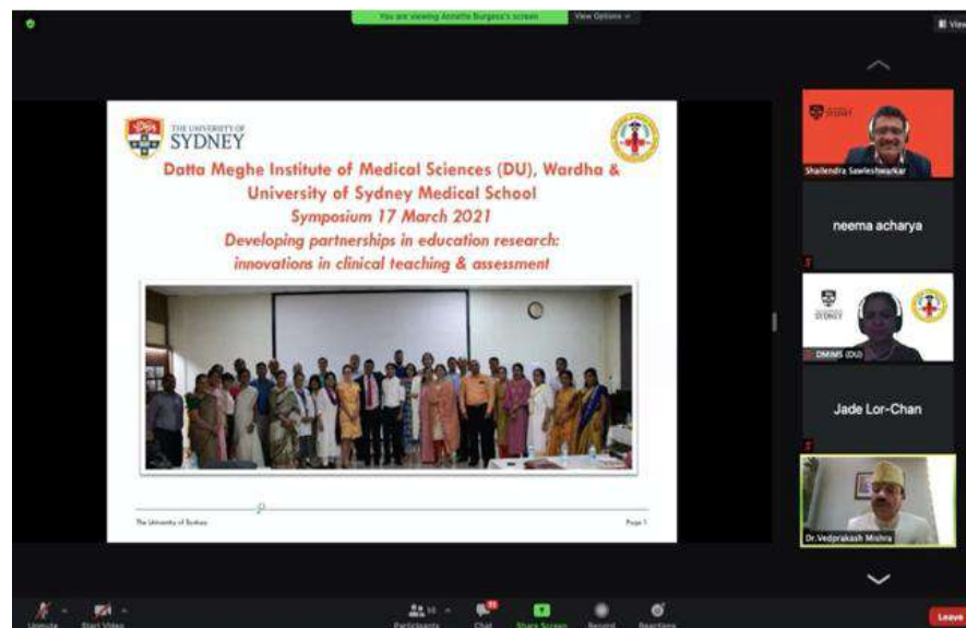
Virtual Inaugural Function of the Symposia