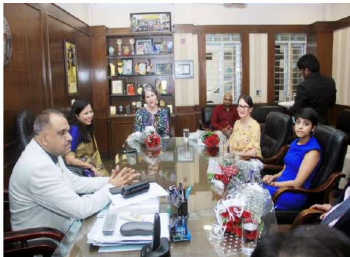
Meeting of DMIMS & USDY team.