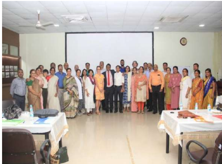
Group Photo of Workshop Participants with Resource Faculty of Sydney