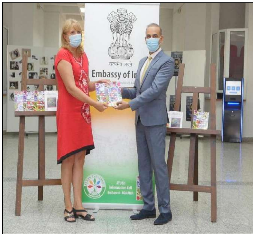
AMN & Indian Embassy in Bucharest, Romania on the occasion of inuragratoion of Book “Ayrveda in Romania”