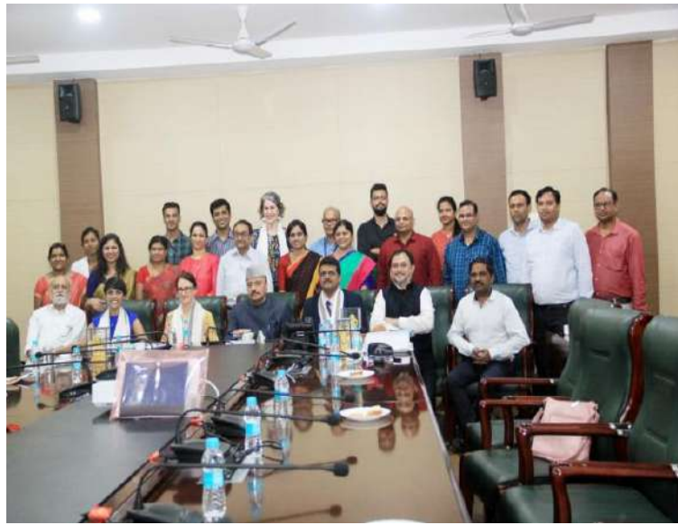
DMIMS(DU) & USDY Team