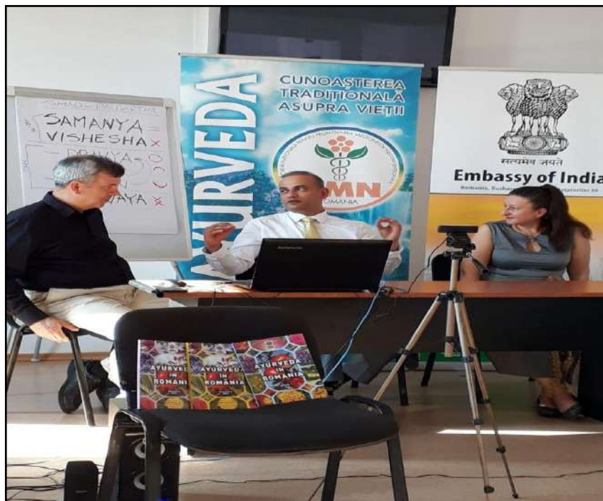
AMN & Indian Embassy in Bucherest, Romania on the occasion of inuragration of Book “Ayrveda in Romania”